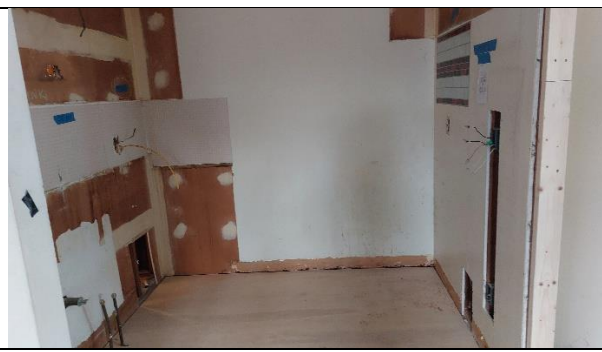
As part of the kitchen remodel the soffits, chimneys, and sections of wall were removed to allow additional cabinets, a dishwasher, and induction stovetop ranges to be installed.