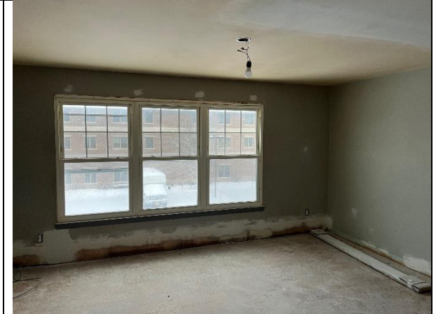
All three buildings will now have modern energy efficient windows throughout. The windows in the third building will be installed soon.