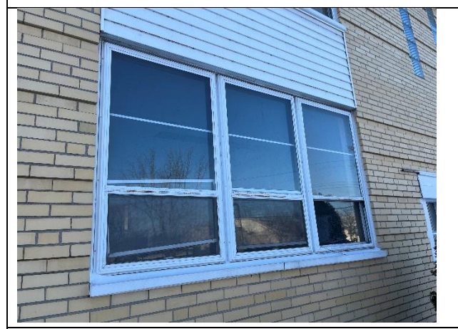
The apartment windows in two of the three buildings were not energy efficient and did not operate well.