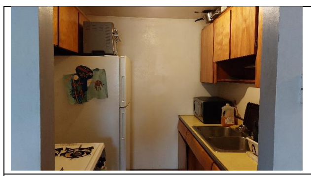
The apartment kitchen layouts were dated and not conducive for our future residents, so the kitchens were gutted.